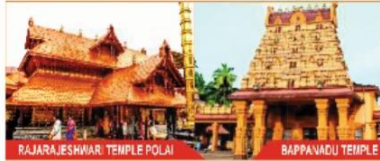
RAJARAJESHWARI TEMPLE POLAI