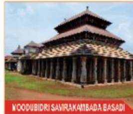
WOODBIDRI SAVIRAKAMBADA BASADI