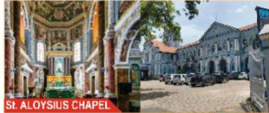
ST. ALOYSIUS CHAPEL