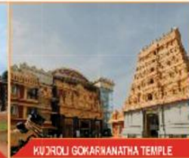
KUJRALU GOKARNANATHA TEMPLE